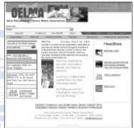
OELMA home page

tates better access to information available – providing you with easier access to information available!